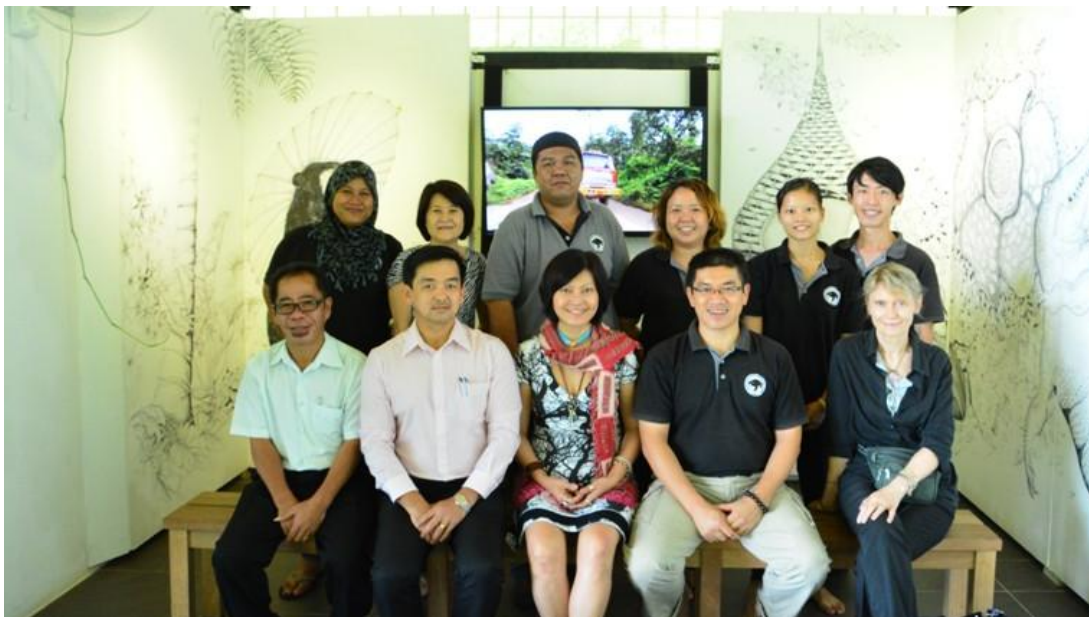
A group photo with board members and LEAP and BSBCC staff after the board meeting on 30 th October 2014.

Throughout the year, three meetings were held between partners LEAP, SFD and SWD, on 18 th March, 17 th July and 30 th October 2014. During the last board meeting, LEAP officially phased out as a BSBCC partner. We would like to express our greatest gratitude to LEAP for all the help they provided throughout the years since the establishment of BSBCC. We couldn't have gone this far without their help.