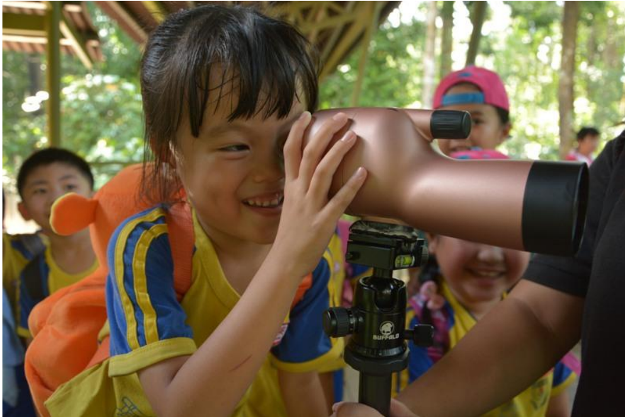
A little girl viewing sun bears on the trees through the spotting scope donated by Sandakan Foto.

A Nikon spotting scope was donated by Irene Chong from Sandakan Foto. This allowed visitors to view sun bear activities closer from the observation platform, especially those bears high up resting in the trees.