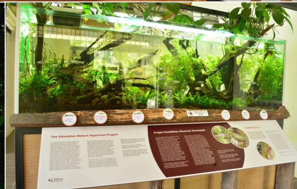
Top: The murals installed on the walls of BSBCC audiovisual room Bottom left: One of the signboards installed along the trails highlighting threats to sun bears from poaching. Bottom right: The Education Nature Aquarium Project at the BSBCC Visitor Centre.