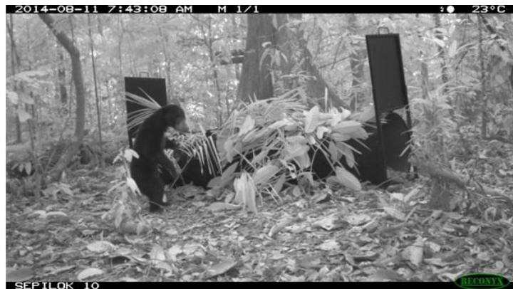
A camera trap image of Natalie approaching one of the sun bear traps set up in the forest.

A 4 year old female sun bear, Natalie, escaped from the BSBCC enclosure on 23 rd July 2014, by climbing a 40m high tree branch connecting with a branch outside her enclosure. She then ranged freely in the adjoining Sepilok-Kabili Forest Reserve. A search and recapture team comprising staff of BSBCC, SWD and the Wildlife Rescue Unit started operations immediately after the escape. A total of 8 sun bear traps and 11 camera traps were set up around the Reserve to aid in the operation. Natalie was seen coming back to BSBCC 4 weeks after her escape. A modified trap set up on the cage in the bear house managed to trap Natalie back to the facility on 29 th August – 37 days after she escaped.