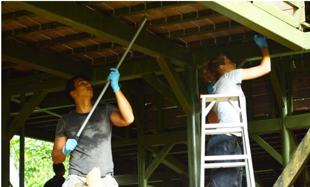
Volunteers helping with repainting of platform structures.

A layer of BRC mesh was installed on the perforated walls of the visitor centre. This was to prevent orangutan and macaque break-ins to the building which occurred early in the year. Installment of the BRC mesh was done by contractors.