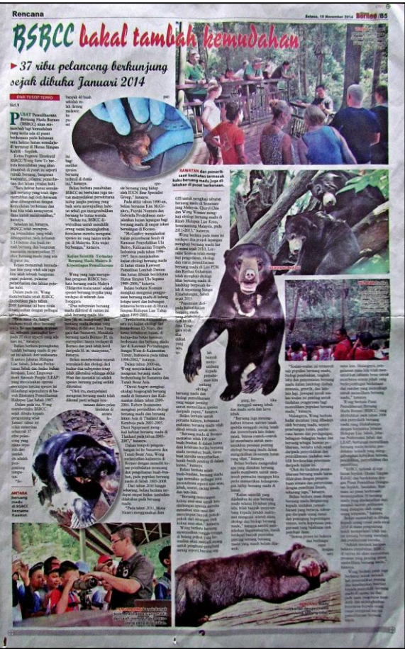
Top left: Surrender Sun Bear Body Parts For Certification- Director, The Borneo Post, January 14, 2014. Bottom left: Sun Bear Centre in Sandakan Opens to Public, The Borneo Post, January 17, 2014. Right: BSBCC to Expand Facilities. 37 thousand tourists visit since the opening to the public in January 2014 (In Malay), Utusan Borneo, November 18, 2014.