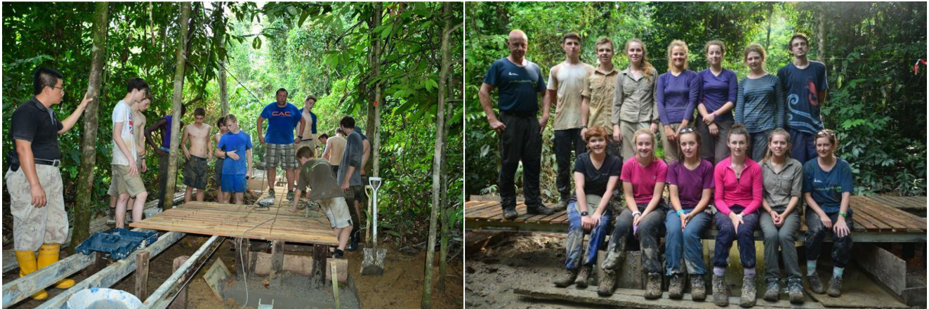
Left: Desborough Team at the working site Right: Farlingaye Team, one of Bear Action Team (BATs) volunteer group that helped the Centre build perimeter boardwalk for the new forest enclosure.