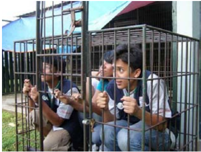
Local children learning firsthand how it feels to be a bear in a cramped cage!

Participants from the YAWA 6 th International Children's Conference on the Environment visited BSBCC from 2 nd – 4th June 2009. The children learned about the various conditions and hardships faced by sun bears in captivity and also about sun bear ecology and behaviour.