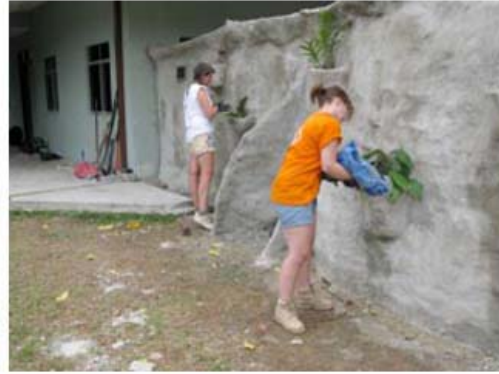
New screening wall in front of the existing bear house, built to minimize disturbance to the bears from visitors (left); Camps International volunteers 'dressing' the wall with foliage (right).