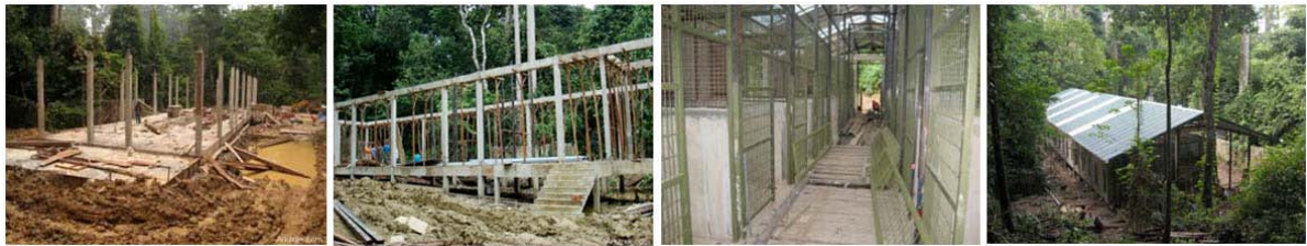
Progress of the new bear house construction from July – December 2009.

Fencing. The construction of the perimeter fencing using existing belian, as well as the chainlink fencing between the 4 large and 2 small forest enclosures, was also slightly delayed due to rains. It was 40% complete by the end of 2009. The deadline for completion was extended to February 2010, after which hot-wiring (the installation of an electric fence), will be carried out by a specialized contractor to prevent bears from escaping from their outdoor enclosures.