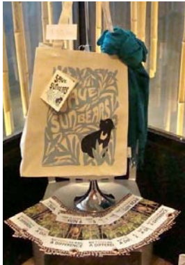
Tote bag with a sun bear motif.

awareness about sun bears in the US. The bags were sold during a one-day sale in her office and also may be ordered by e-mail. All proceeds are donated to BSBCC.