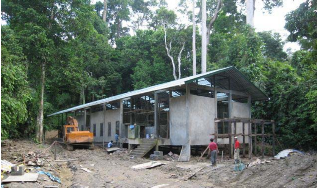
Bear house under construction during Phase 1