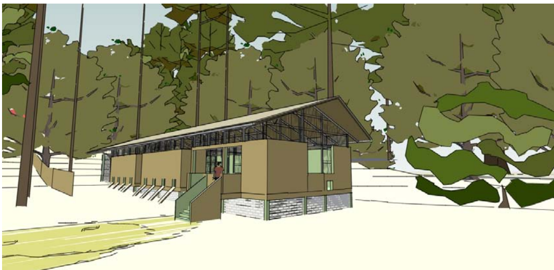
Architect's Drawing of the Phase I Bear House with a capacity for 20 bears

Bear House. Construction of the new bear house progressed smoothly through most of 2009, but due to heavy rain towards the end of the year, the final completion date was extended to early 2010. By the end of 2009, the bear house was approximately 75% completed, with only portions of the electrical fittings, plumbing, painting and some welding and flooring and external works still to be completed.